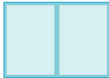
Double Page Spread